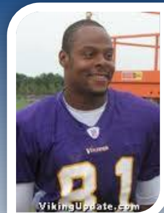
Visanthe Shiancoe NFL Player