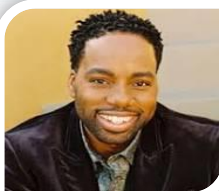
David Talbert Movie Director "Baggage Claim"