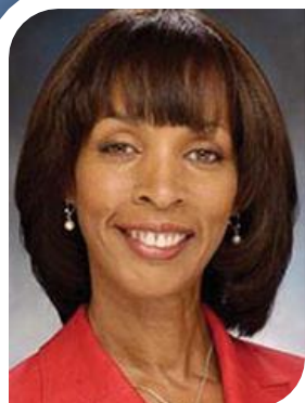
Catherine Pugh Politician