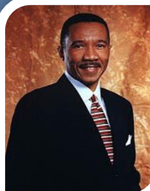
Kweisi Mfume NAACP