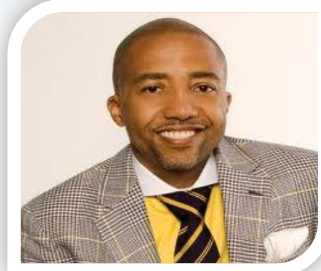
Kevin Liles Former President Def Jam Recording