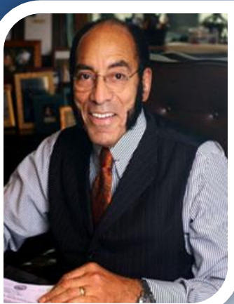
Earl G. Graves Black Enterprise