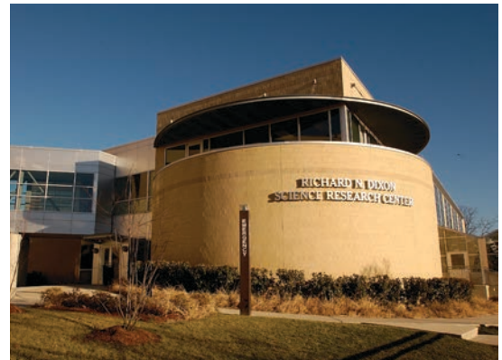
Upgrading the research labs in the Dixon Science Research Center