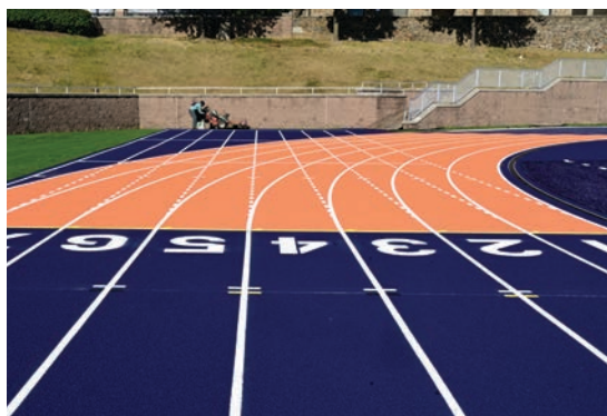
Replacing the track and field of Hughes Stadium