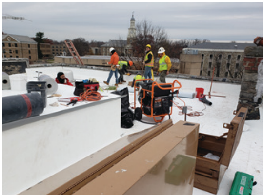
Baldwin Hall Roof

The University has also dedicated operating funds and funds borrowed from the HBCU Capital Financing Program to address this backlog of needs. Work funded by these sources includes: the replacement of roofs, room heating systems and restroom cabinets, and repair of exhaust fans in residential buildings. These funds have also been used to address issues in academic and athletic facilities to include: upgrading the research labs in the Dixon Science Research Center and relocating the mechanical systems from the roof to stop the vibrations; changing and repairing the lighting systems in Murphy Fine Arts Center; purchasing air handling and heating units for several buildings, repairing the pool in Hurt Gym; repairing lab fume hoods; changing the flooring in Engineering; modifying engineering labs; and replacing the track and field of Hughes Stadium.