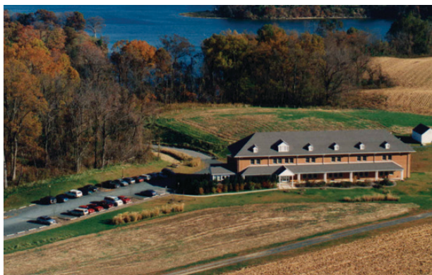
Patuxent Environmental and Aquatic Research Laboratory (PEARL)

The FY 2021 funding will be used to continue work on the West Campus site improvements; upgrade various building security, fire and safety and utility systems; address water infiltration issues in Truth Hall; and insulate the attic at the Patuxent Environmental and Aquatic Research Laboratory (PEARL). We are committed to our deferred maintenance plan to ensure the University adequately protects and effectively utilizes State-funded building assets.