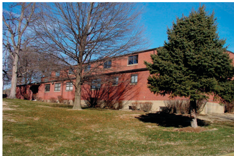
Turner's Armory and Motor Pool

This request provides additional design funds for the construction of a New Health and Human Services (HHS) Building to house the School of Community Health and Policy which includes Public Health, Nutrition Sciences, Nursing, Pre-Professional Physical Therapy and Health Education; the School of Social Work; the Department of Family and Consumer Sciences; and Medical Technology. The University Counseling Center will also be housed in this facility. The academic programs to be located in the new HHS are now located in Jenkins, which is to be demolished; off-campus in the Portage Avenue Facility, which is unsafe; and in Hurt Gym. These locations offer limited or substandard teaching, research and clinical space for the preparation of our students. The Counseling Center is located in Carter-Grant-Wilson, an outdated building that lacks sufficient and appropriate space to properly service our students. The co-location of these related academic and health service programs will promote collaboration, optimize space through the provision of shared resources and enhance students' learning experience. The New Health and Human Services Building will be located at the corner of Argonne Drive and Hillen Road at the site of the Turner's Armory and Motor Pool. The first phase of design funding was authorized this past legislative session, and design is now underway.