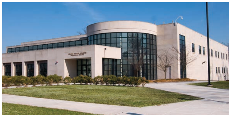
William Donald Schaefer Engineering Building.

1st in African-American Studies, Bioinformatics, City and Regional Planning, Community College Administration and Instruction, Higher Education Administration, Hospitality