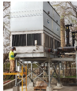
Relocating the mechanical systems from the roof of Dixon Science Research Center to stop the vibrations