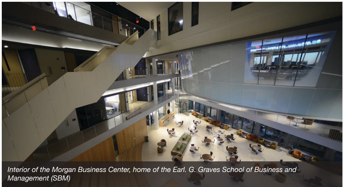
Interior of the Morgan Business Center, home of the Earl. G. Graves School of Business and Management (SBM)

The Earl G. Graves School of Business and Management (SBM) is the home of The Center for the Study of Blockchain and Financial Technology ("The FinTech Center"). The Center was launched in February 2019 after Morgan received a multiyear, multimillion-dollar