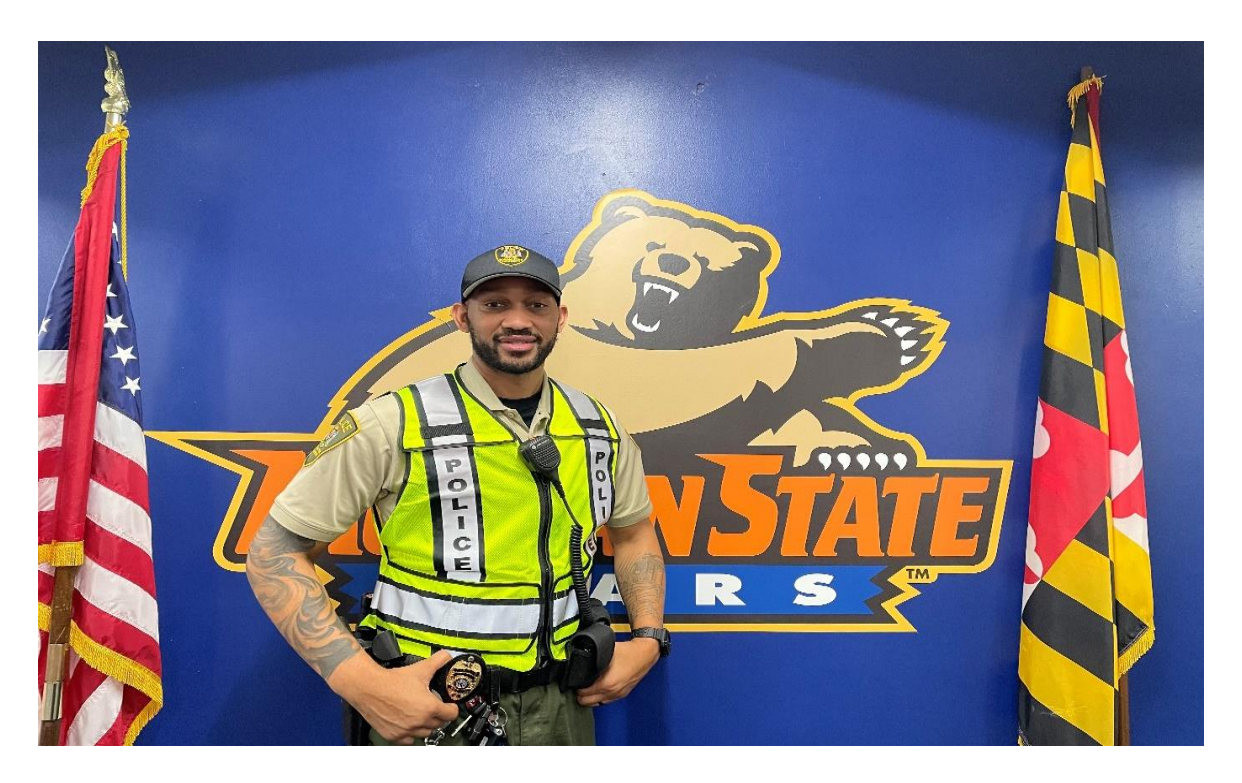
Morgan State University Police Department: Who Are We?

Morgan State University (MSUPD) is open 24 hours a day, 365 days a year. The telephone number for emergency calls is 443-885-3103. The telephone number for routine business calls is 443-885-3100. The Police and Public Safety consists of sworn and commissioned Police Officers who have statutory powers of arrest and Public Safety Aides (University Security Guards) and contract security guards dedicated to providing best in class service to the community. Officers patrol the campus on foot, by bicycle, and in motor vehicles. Several officers and a supervisor are on duty 24 hours a day. The Communications Center is staffed with trained dispatchers who receive calls for service, dispatch officers to respond to emergency calls for assistance and qualifying incidents, and monitor intrusion detection and fire alarms. MSUPD staff also carries out a variety of roles, including operating the campus escort program.