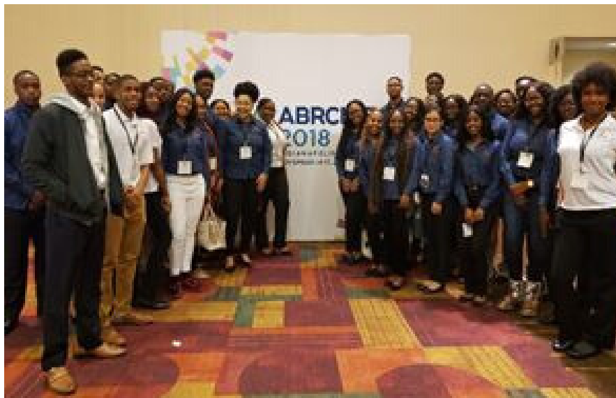
ASCEND Scholars at the 2018 Annual Biomedical Research Conference for Minority Students (ABRCMS) in Indianapolis, Indiana