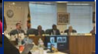
Md Board of Education Mtg