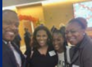
Wallace Foundation PLC