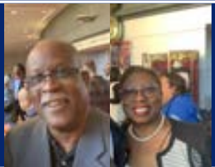
Md Cultural Proficiency Conference