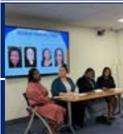
DPT Meeting at Howard