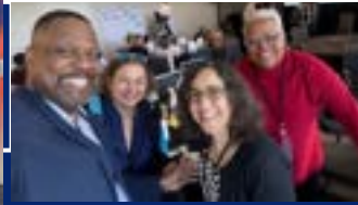
Wallace PLC in San Diego