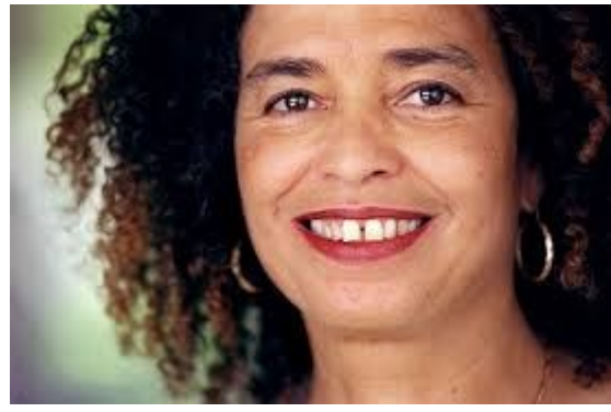
Angela Davis, social activist

Angela Davis, a proud feminist, Black Panther, prominent social activist, and retired University of California philosophy professor, majored in philosophy at Brandeis University and worked under Herbert Marcuse. These studies strongly influenced her campaigns against racism, capitalist inequalities, sexism, and anti-LGBTQ sentiment.