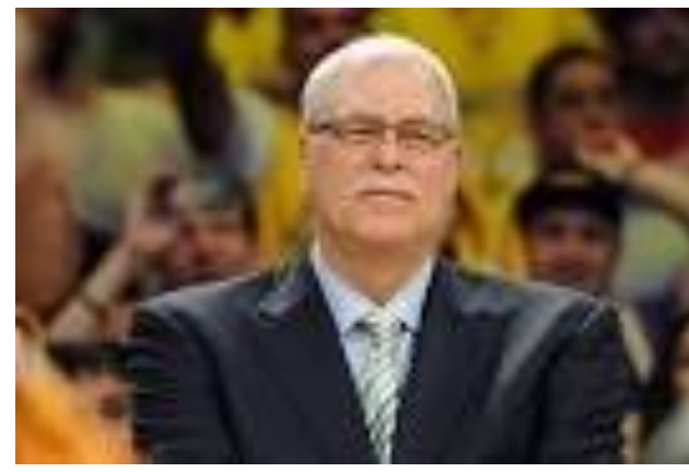
Phil Jackson, NBA coach

Phil Jackson, legendary Chicago Bulls and Los Angeles Lakers coach, majored in philosophy at the University of North Dakota. Players, contemporaries, administrators, and fans call him "The Zen Master." Inquiries into Eastern philosophy helped him develop the coaching style that won him 11 championships as a coach, added to the two earned as a player. He even published a book, Sacred Hoops , about how sport and philosophy interplay in his mind.