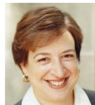
Elena Kagan U.S. Supreme Court Justice

Justice Kagan attended Princeton University where she wrote a senior thesis on the history of American radicalism in the hope of clarifying her own political ideas. She received a fellowship and went to England for a year to study philosophy at Worcester College at Oxford, where she received a Masters of Philosophy degree. She was nominated to the bench by President Obama in May, 2010.