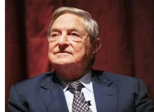
George Soros, billionaire banker

"The Man Who Broke the Bank of England" completed his Bachelor of Science degree in philosophy in 1952 at the London School of Economics. He scored an entry-level job at graduation at Singer & Friedlander, a bank. George Soros applied the critical and analytical skills students of philosophy learn to the world of finance to eventually become up a billionaire, launching his own hedge fund and investment firm.