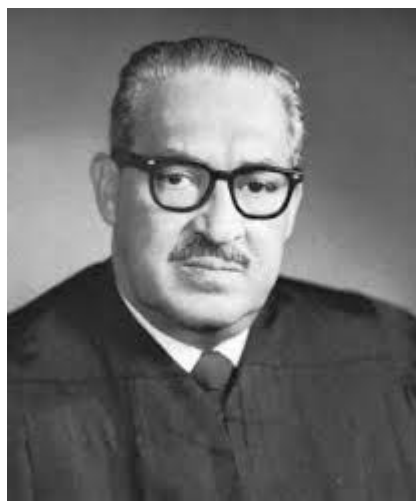
Thurgood Marshall, U.S. Supreme Court Justice

Born in Baltimore, Maryland, Thurgood Marshall was the great-grandson of a slave. He studied literature and philosophy at Lincoln University. He founded the NAACP Legal Defense and Educational Fund. He argued many civil rights cases, most famously Brown v. Board of Education of Topeka in 1954. In 1967 he became the first African American Supreme Court Justice.