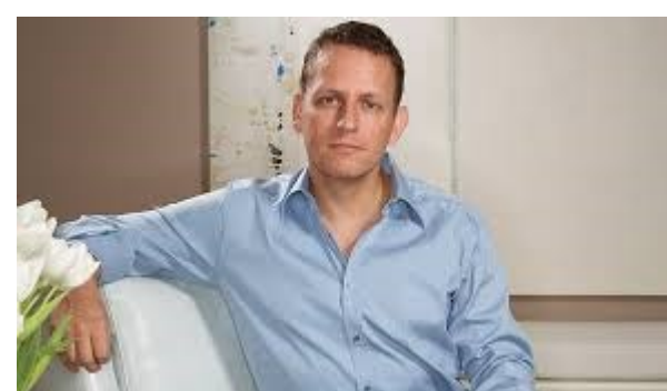
Peter Thiel, founder of Pay Pal

Thiel got his undergraduate degree in 20th Century Philosophy at Stanford in 1989, and a law degree in 1992. Thiel was the co-founder and CEO of PayPal. He currently serves as president of Clarium Capital, and as a managing partner at venture capital firm, the Founder's Fund. He was also the first outside investor in Facebook.