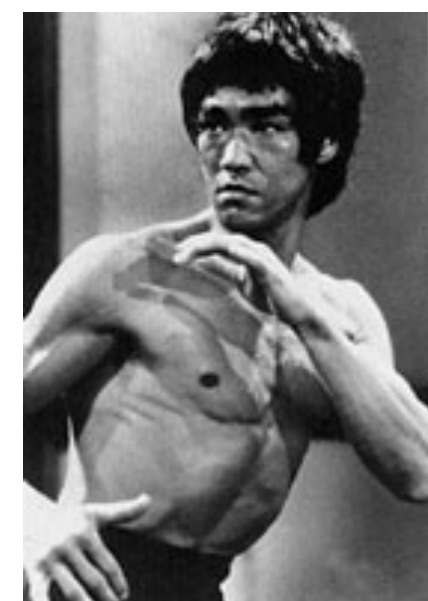
Bruce Lee, martial artist and filmmaker

Bruce Lee studied philosophy extensively at University of Washington and beyond. He read the Tao Te Ching and was inspired by the concept of wu wei , action accomplishing its purpose in accordance with the natures of things and events. He frequently touted philosophy's role in shaping both his acting and his athletics.