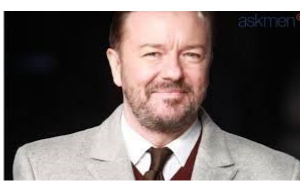
Ricky Gervais, actor and comedian

The famous comedian of TV shows Extras and The Office majored in philosophy at University College London. Fans can certainly see the humorous benefits of devoting time, energy, and money towards the philosophical arts if pursuing an entertainment career.